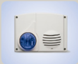
Outdoor Siren/Strobe - Improve police response and deterrence

The next on-camera performance is a mug shot.