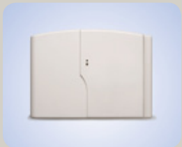
Indoor Siren - Increase deterrence with additional sirens